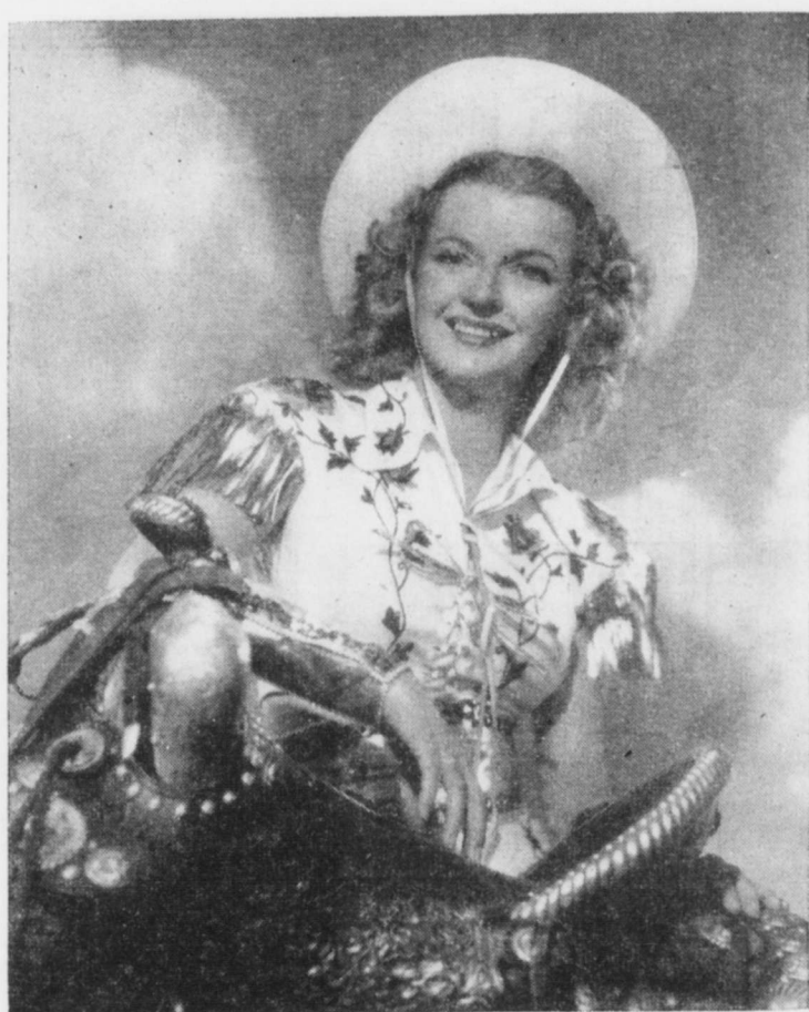
Dale Evans, Republic Picture Star