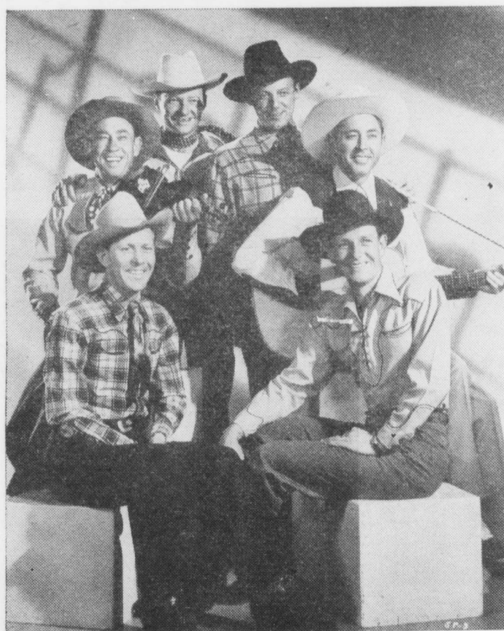
SONS OF THE PIONEERS Stars of Radio and Pictures